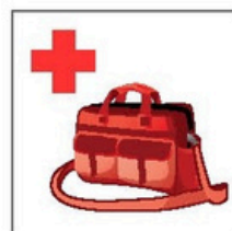
Medically Necessary and Diaper Bags*

*Infant and Medical supplies will be permitted after proper inspection.