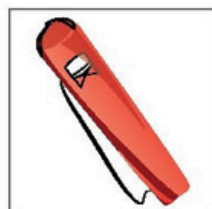
Folding Chair Bag (Folding Chair is Allowed)

FOR MORE INFORMATION GO TO PGATOUR.COM/ProhibitedItems