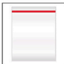
1-Gallon Plastic Freezer Bag