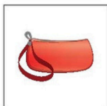
Bags smaller than 6" x 6" x 6"