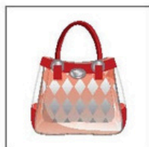
Printed Pattern Plastic Bag