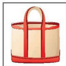
Over-sized Tote Bag