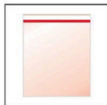
Tinted Plastic Bag